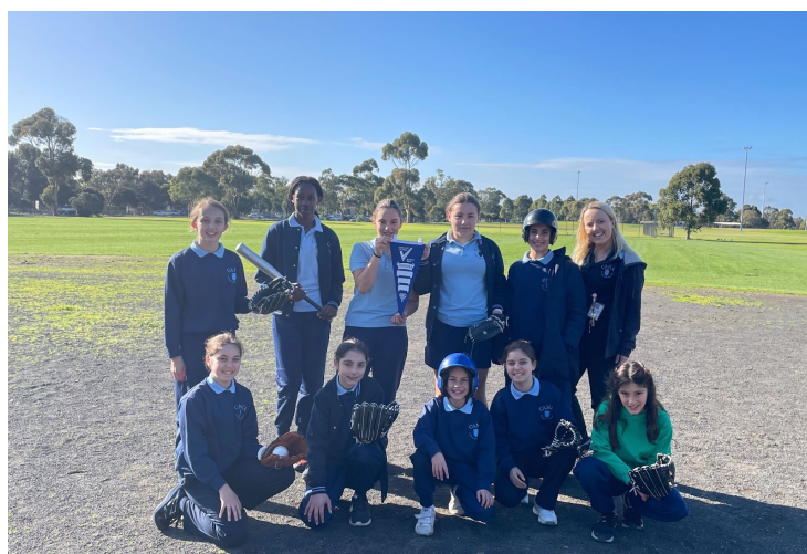
2023- Premiers: Girls T-ball