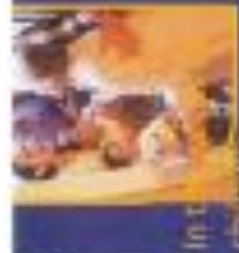
(1) 1. Children

"Grandparents are God's reward for being a parent."