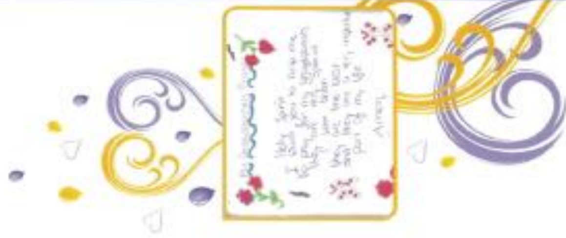
A Resource of the Archdiocese Catholic Marriage and Family Council for the Betrothal Celebration for Pastoral Life